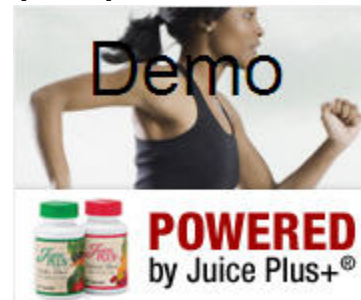
(11A) – 180x150 pixels - 14.7KB