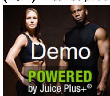
(15A) – 180x150 pixels - 14.4KB