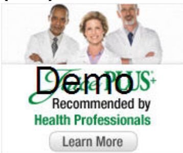
(13A) – 180x150 pixels - 13.3KB