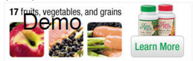
(10C) – 312x100 pixels - 18.5KB