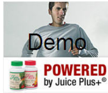
(14A) – 180x150 pixels - 14.8KB