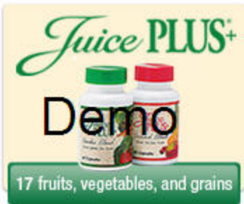
(9A) – 180x150 pixels - 14.5KB