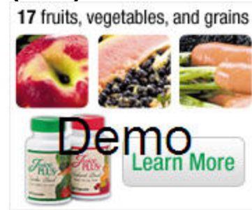
(10A) – 180x150 pixels - 17.7KB