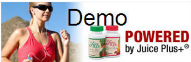
(12C) – 312x100 pixels - 17.4KB