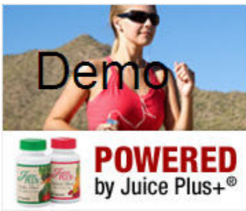
(12A) – 180x150 pixels - 17.8KB